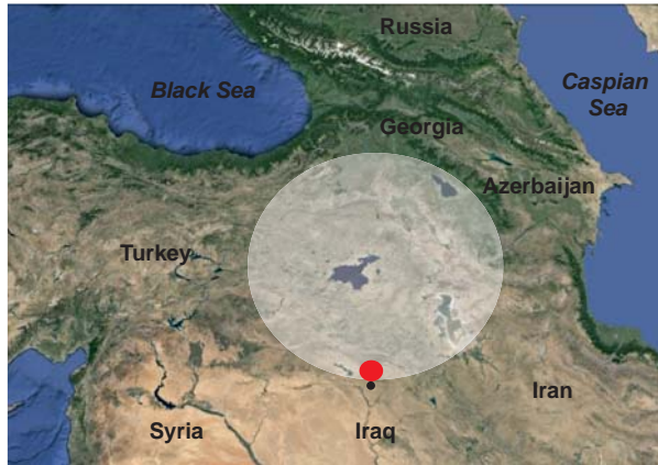
Fig. 4. Possible location of the Ark's resting place, according to the Ross flood model. The shaded area is the region identified in Genesis 8:4 as the "mountains of Ararat." Red dot shows the likely landing location for Noah's Ark. Black dot indicates where the ruins of the ancient city of Nineveh have been found.

three hundred feet [60.9–91.4m] deep." Assuming that sea level then was at least 250ft (76.2m) lower than today, the waters of the flood in Ross' model must have risen to nearly 600ft (182.8m) above sea level at that time. These waters connected to the Indian Ocean through the Strait of Hormuz, so how could the water have piled up in Mesopotamia nearly 600ft (182.8m) higher than the sea level of that time? The Strait of Hormuz is slightly wider than 20mi (32.1km) at its narrowest point today, but with water level in the Persian Gulf nearly 350ft (106.6m) higher than today's sea level, the Strait of Hormuz would have been even wider then. Given the depth and width of the Strait of Hormuz, it would have been impossible for the water to have been impounded to a depth of 20ft (6m) across the Mesopotamian plain, let alone a depth of nearly 600ft (182.8m). A local flood of any appreciable depth would have required a considerable physical barrier at the Strait of Hormuz. This is a major problem for Ross' model. Absent such a barrier, Ross' so-called model is no model at all.