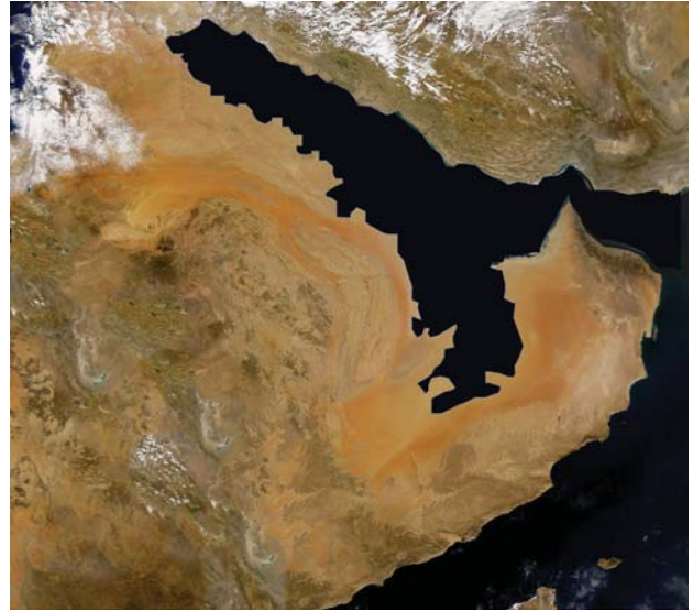
Fig. 3. The probable extent of Noah's Flood at its peak, a little over 300,000 mi 2 (777,000 km 2 ), according to the Ross flood model.

feet lower than today, with sea level at any particular time dependent upon the amount of water locked up in glaciers. While both the Red Sea and the Persian Gulf today are much deeper than a few hundred feet, their connections to the Indian Ocean (the Mandeb Strait and Gulf of Aden for the Red Sea and the Strait of Hormuz for the Persian Gulf) are relatively shallow. However, today there is a path that is no shallower than 250ft (76.2m) through the Strait of Hormuz. The path through the Mandeb Strait and the Gulf of Aden has a similar minimum depth. Hence, if the Persian Gulf and Red Sea mostly were dry at the beginning of the Flood as in Ross' model, then the Flood must have happened when sea level was at least 250ft (76.2m) lower than today.