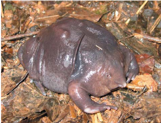
Fig. 33. Nasikabatrachus sahyadrensis .

established themselves and their tadpoles have a stream morphology (thin and stream-lined) designed for fast flowing streams (Amphibiaweb 2013). Other characters include knob-like snout, rigid upper jaw, flap-like lower jaw which forms a grooved opening for tongue, no maxillary teeth, small eyes, single subgular vocal sac in males, no tympanum, little webbing in hands, round toes in feet with three-quarters webbing, horizontal pupils, strongly ossified skull, paired frontoparietals and palatines, eight procoelous presacral vertebrae, and pseudoarciferal pectoral girdle (Amphibiaweb 2013; Vitt and Caldwell 2009, p. 445).