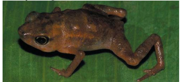
Fig. 55. Didynamipus sjostedti .