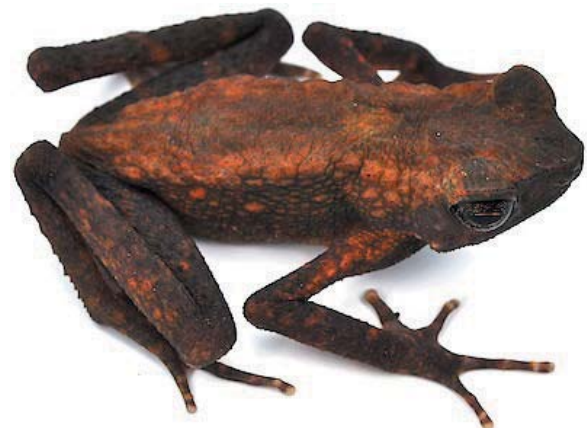
Fig. 52. Ansonia leptopus .

This is a stream spawning south-east Asian toad with tadpoles having stream or torrent morphology.