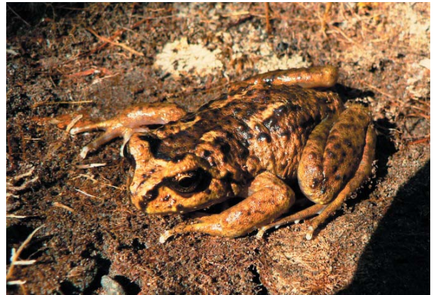
Fig. 43. Alsodes verrucosus .

These frogs are found in Chile and Argentina (Amphibiaweb 2013).