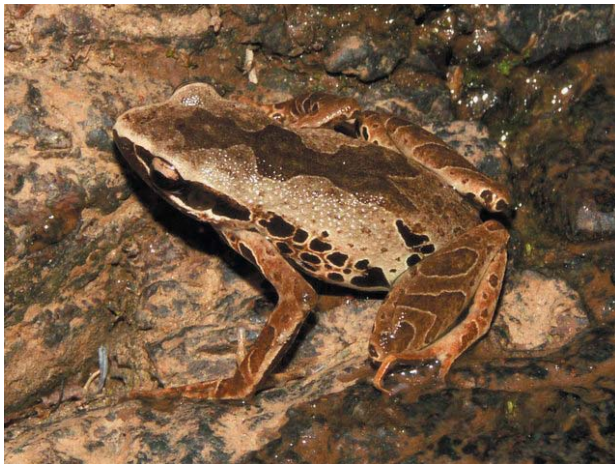
Fig. 37. Cardioglossa leucomystax .