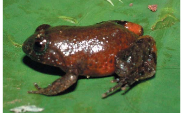
Fig. 38. Leptodactylodon erythrogaster . Source: http://www.edgeofexistence.org .