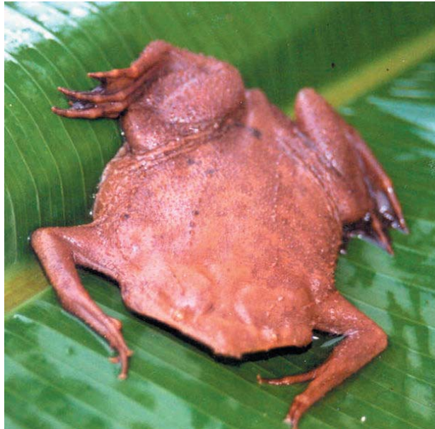
Fig. 16. Pipa pipa .

A South American anuran, Pipa reproduction is highly unusual as inguinal amplexus and turnover behavior may last hours. As the female rolls on her back and releases eggs, the male will fertilize them and push them into her dorsal skin. The 12 hour amplexus may provide the time and stimulation needed for the back of the female skin to morphologically change so that fertilized eggs can embed and develop there. This is called dermal brooding (Vitt and Caldwell 2009, p. 440). In three species ( P. arrobali , P. aspera , and P. pipa ) development is direct and toadlets hatch from skin pockets (Amphibiaweb 2013). For P. carvalhoi , P. myersi , and P. parva development is indirect and Orton Type I tadpoles emerge from the skin and finish their metamorphosis in the environment (Amphibiaweb 2013; Vitt and Caldwell 2009, p. 440). The developmental process in P. snethlageae is unknown and no hybridization data was found. Because of their unique dermal brooding, respiratory anatomy, my desire to avoid underestimating Ark kinds, and relative ease of keeping in captivity, I include them in the Ark as a kind.