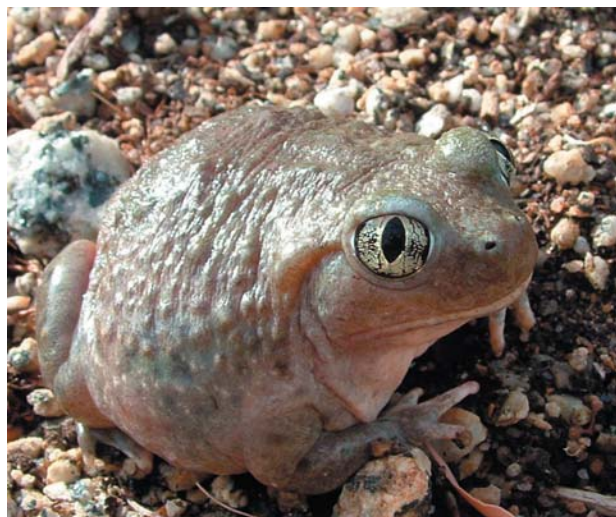
Fig. 9. Spea hammondi .

These families were classified as one family, Pelobatidae , but have recently been separated. Because of very similar morphology and behavior, I am tentatively keeping them as one kind . Common traits include warty and soft skin, fused sacrum and urostyle joint, keratinized "spade" on each hind foot that is used for digging, eight presacral amphicoelous vertebrae, arciferal pectoral girdle, distinct sternum, absent palatines, vertical pupils, facial nerve exiting in front of acoustic foramen in the auditory capsule, no