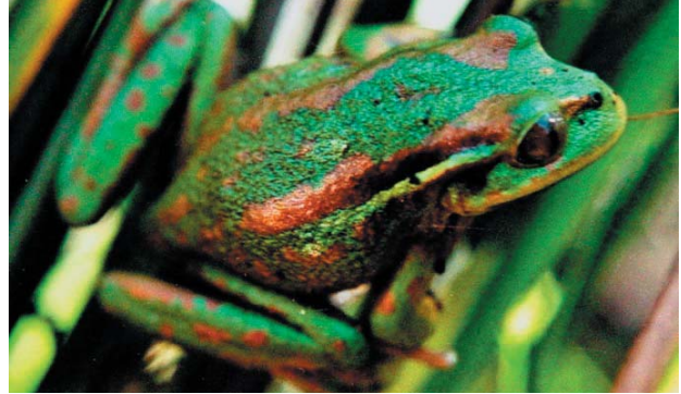
Fig. 48. Hylorina sylvatica .