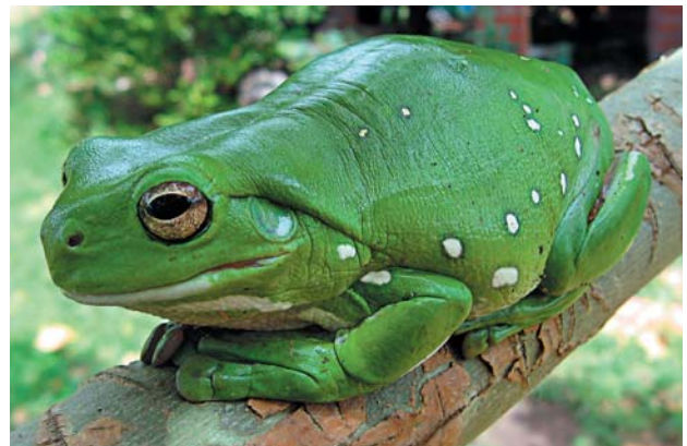
Fig. 76. Litoria caerulea .

This group contains mostly arboreal to terrestrial and a few semi-fossorial species (Vitt and Caldwell 2009, p. 452). Interesting examples include Cyclorana platycephala , also called the water holding frog because of their ability to store water in their bladder which Aborigines would squeeze out of them when they were thirsty (Amphibiaweb 2013). Litoria nasuta is called the rocket frog by Australian children because it can jump a meter or more in one bound (Vitt and Caldwell 2009, p. 452).