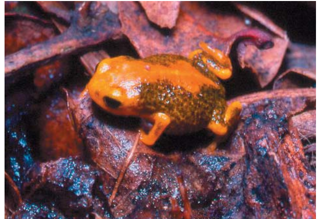
Fig. 24. Brachycephalus pernix .

information is limited to a few species in these genera and no hybridization data has been found, I have defaulted the kind to the level of the genus until more information is known.