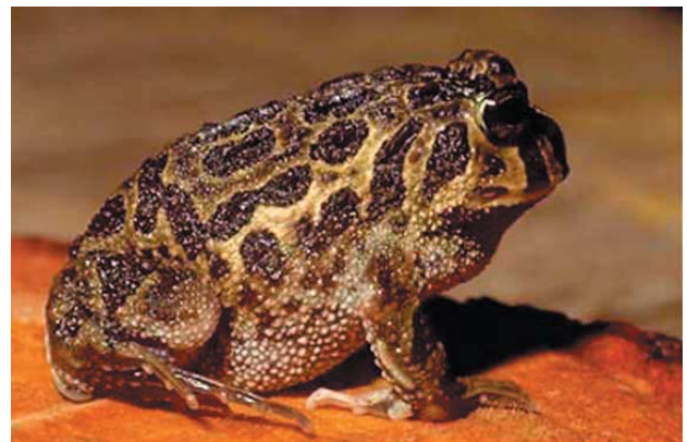
Fig. 82. Odontophrynus americanus .