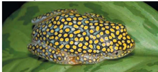
Fig. 79. Heterixalus alboguttatus .

Located in sub-Saharan Africa this group is still in great taxonomic flux. Common characters found in most include pond tadpoles with large tailfins, bright colors, gular (throat) pads in males, competitive calling sites ( Acanthixalus may communicate through pheromones), absence of nuptial pads, cartilaginous sternum, and vertical pupils (Amphibiaweb 2013).