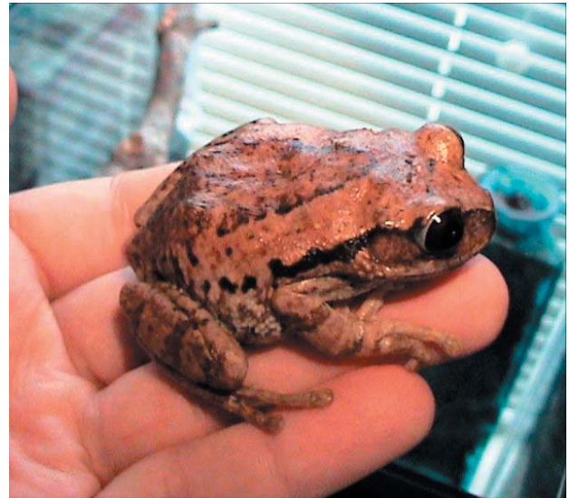
Fig. 39. Leptopelis vermiculatus .