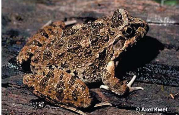
Fig. 45. Limnomedusa macroglossa .