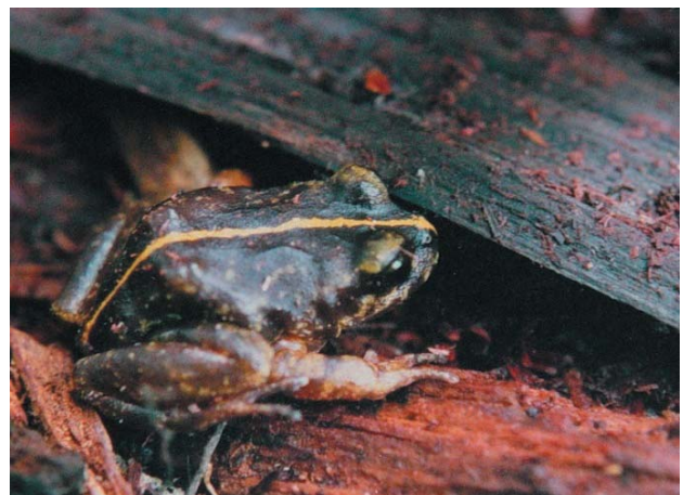
Fig. 44. Eupsophus emiliopugini .

This genus is found in Chile and Argentina.