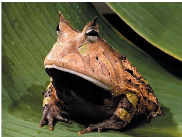
Fig. 18. Ceratophrys cornuta .