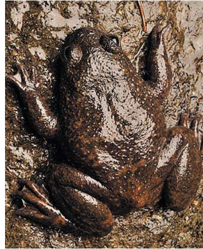
Fig. 6. Barbourula busuangensis .