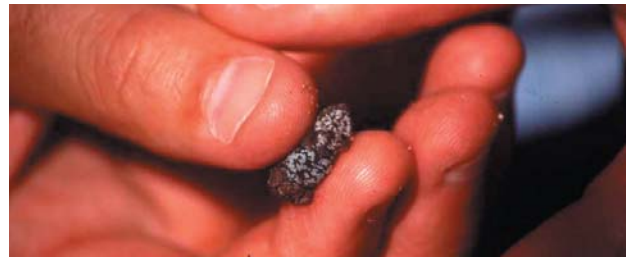
Fig. 61. Mertensophryne micranotis .