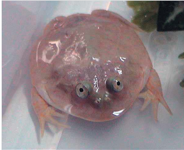
Fig. 71. Lepidobatrachus laevis .

Characters include large teeth on the upper jaw, two large fangs on the lower jaw, rhomboid pupils, short forelimbs and hind limbs, unwebbed digits of the forelimbs, fully webbed hind limbs with a large, and a spade-like, black tubercle on the metatarsal (Amphibiaweb 2013). I have made this genus a separate kind from the rest of the family because of its unique behavior and biology. Species in this genus live in arid places of South America. It is unique in the way it burrows and aestivates during the dry season. It has been designed to withstand the stress by shedding layers of skin that remain connected to the body. As these layers build, they form a cocoon around the frog which protects it from dehydration (Amphibiaweb 2013). When the rainy season arrives, they leave their burrows and find ephemeral pools for breeding and foraging. When their breeding season begins, 1400 eggs may be produced and larval development is rapid (Amphibiaweb 2013). They are both carnivores and cannibals and, though this post-Fall feeding behavior is rare in anuran larvae, what makes them even more unique are their jaws. They have wide gaping mouths, just like the adults, that allow them to ingest their prey whole. This unique feeding behavior is called megalophagy (Amphibiaweb 2013).