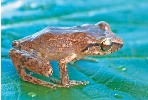
Fig. 80. Eleutherodactylus amplinympha .