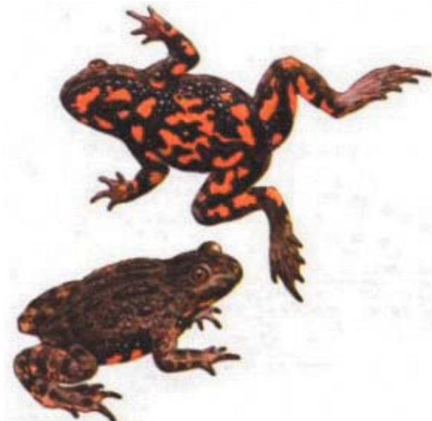
Fig 5. Bombina bombina .