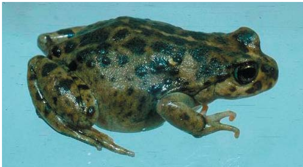
Fig. 46. Atelognathus nitoi .