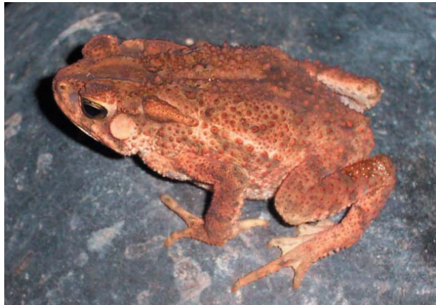
Fig. 59. Bufo biporcatus .