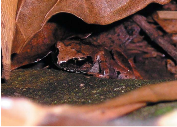
Fig. 35. Arthroleptis wahlbergii .