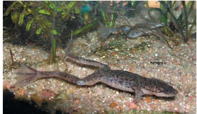
Fig. 14. Hymenochirus boettgeri .

These differ from African clawed frogs in that they are smaller, have four webbed feet, eyes on the sides of their head, and snouts that are flat and curved. All adults and tadpoles may be predatory suction feeders and H. boettgeri males sing (Amphibiaweb 2013). Because little is known about the African genera Hymenochirus and Pseudhymenochirus , the ease in which they are kept in captivity, the respiratory anatomy, and to avoid underestimating kinds, I include them in the Ark as the dwarf clawed frog kind.