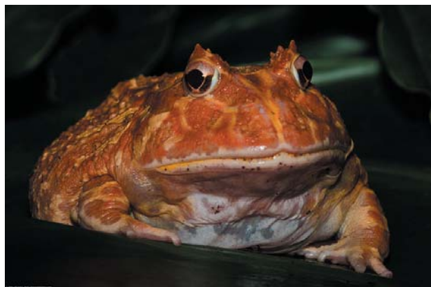
Fig. 70. Ceratophrys ornata .

2 genera—9 Species Ceratophrys —8 species Chacophrys —1 species—SVL=11 cm (4.3")