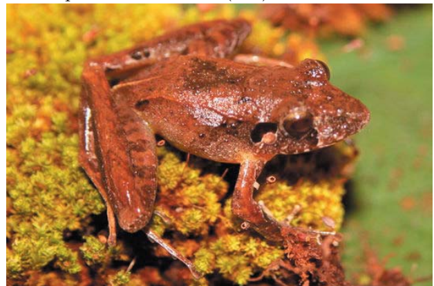
Fig. 25. Ischnocnema guentheri .

They are quite small and are called saddle-back toads because they have bony shields above their vertebrae (Amphibiaweb 2013). Some, such as B. ephippium , have bright aposematic coloration because they produce tetrodotoxin, a strong toxin also found in some newts (Amphibiaweb 2013).