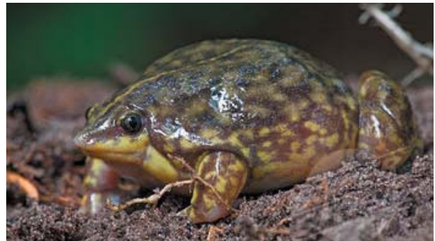
Fig. 32. Hemisus marmoratus .

The organisms in this taxon, from sub-Saharan Africa, have spherical bodies with hard, pointed snouts and strong legs for burrowing underground in their Savannah and sometimes scrub habitats (Amphibiaweb 2013; Vitt and Caldwell 2009, pp.468–469). Reproduction is unique in that they lay eggs underground near the end of the dry season and when the nests flood, tadpoles either swim to ephemeral pools or hitch rides on parents who will transport them to pools where metamorphosis is completed (Amphibiaweb 2013). Other shared characters are similar with ghost frogs with the following differences: no sternum, eight presacral vertebrae with all but the last one being procoelous, fermisternal pectoral girdle, and blunt or pointed terminal phalanges.