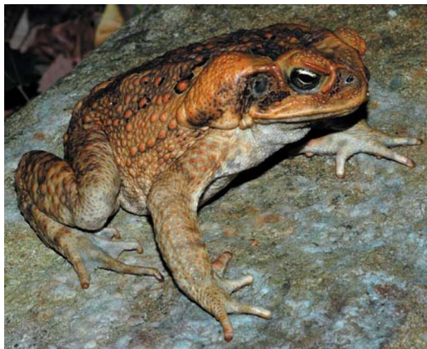
Fig. 67. Bufo marinus .

In Australia, an exotic marine bufonid named the cane toad ( Rhinella marinus ) was introduced in the 1930s to eat beetle pests that were destroying the