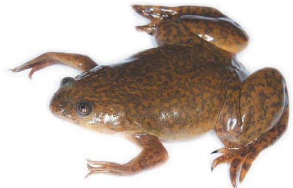
Fig. 15. Xenopus laevis .

African clawed frogs are twice the size of dwarf clawed frogs, have eyes on the tops of their heads, and have pointed snouts. Polyploidy characterizes Xenopus and interspecific hybridization has been documented. It is thought that hybridization produced all 21 species (Vitt and Caldwell 2009, p. 439).