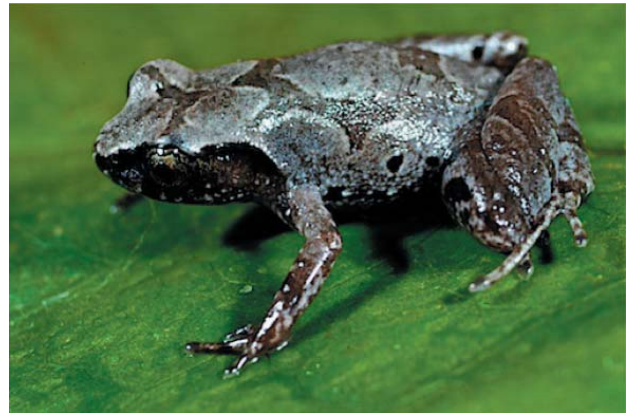
Fig. 19. Leptobrachella baluensis .