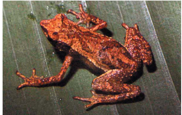
Fig. 54. Dendrophryniscus berthaltutzei .