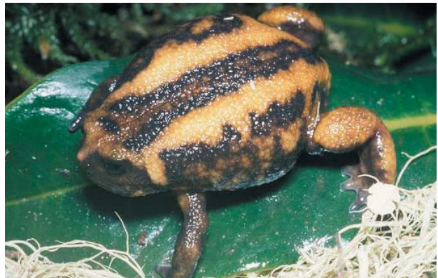
Fig. 49. Balebreviceps hillmani .

5 genera ( Balebreviceps , Breviceps , Callulina , Probreviceps , Spelaeophryne ) 34 species—SVL=4 cm (1.5")