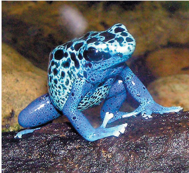
Fig. 74. Dendrobates azureus . Source: http://en.wikipedia.org .