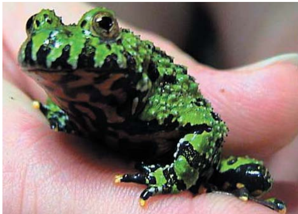
Fig 4. Bombina orientalis .