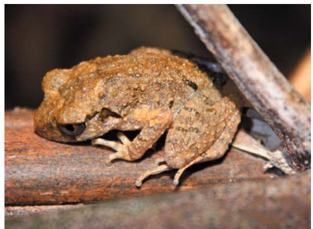
Fig. 21. Leptolalax liui .