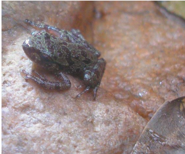
Fig. 30. Heleophryne orientalis .