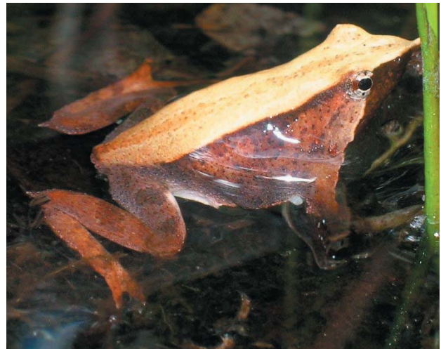
Fig. 85. Rhinoderma darwinii .

Their family name comes from the proboscis looking structure on the top of their snouts (Amphibiaweb 2013). Taxonomists would include this family in Leptodactylidae but they do not because they lay eggs on land and tadpoles either develop in the vocal sacs of males ( Rhinoderma darwinii ) or are carried to water and released by males of Rhinoderma rufum (Amphibiaweb 2013).