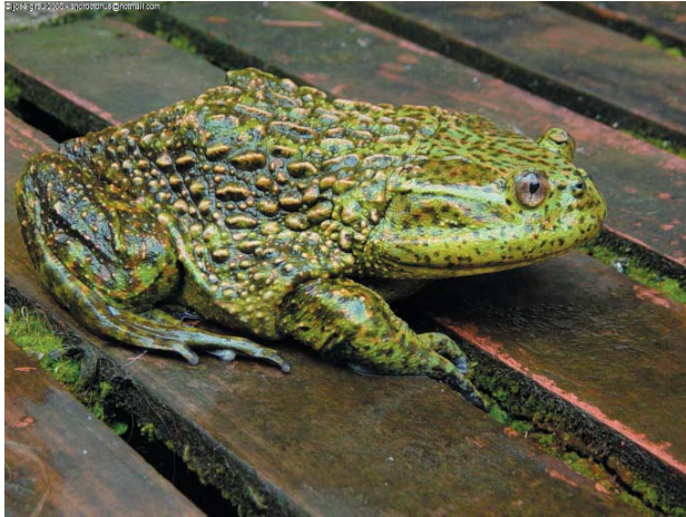
Fig. 26. Calyptocephalella gayi .

These are large aquatic frogs with the following characters: vertical pupils, bronze irises, visible tympanum (ear drum), elongated bumps on skin of dorsum, unwebbed fingers and partially webbed toes (Amphibiaweb 2013).