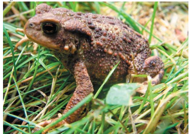
Fig. 51. Bufo bufo .