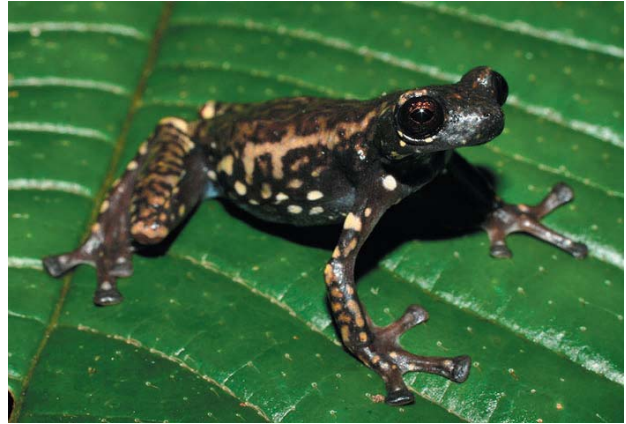
Fig. 17. Allophryne ruthveni .

This is a terrestrial, semi-arboreal South American frog that lives on low shrubs from 1–3m (3.2'–9.8') tall. It is an explosive breeder and has been very difficult to classify. They have recently been separated into their own family (Amphibiaweb 2013). They superficially look like a member of the tree frog family (Hylidae) and used to be classified there. However, tree frogs have claw shaped terminal phalanges where Allophrynidae have T-shaped terminal phalanges (as is found in other families such as Heliophrynidae). Molecular data places them as a sister taxon to Centrolenidae or the glass frogs which seems consistent with the observations that sometimes their ventral side is transparent so that internal organs are seen, while weak molecular data places them in Centrolenidae (Amphibiaweb 2013). Other traits uniting this controversial family include eight presacral vertebrae, no ribs, a free urostyle, an arciferal pectoral girdle, clavicles that don't overlie the scapula, no teeth, sartorius muscle separate and distinct, horizontal pupils, palatines present, astragalus and calcaneum completely fused, Orton Type IV aquatic larvae, and no fossil data (Amphibiaweb 2013; Cannatella 2008a). No hybridization data was found either. Since there is so little data regarding their life history and the taxonomic status is controversial, I shall keep them as a separate kind until further research illuminates their taxonomic status.