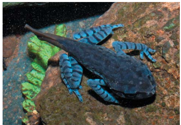
Fig. 20. Leptobrachium hasseltii .