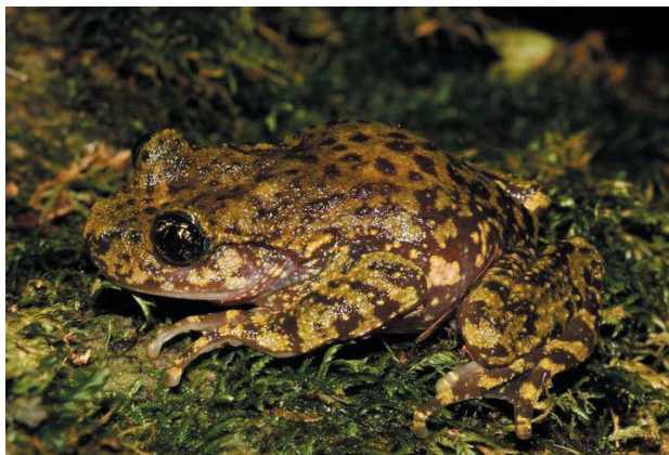
Fig. 31. Hadromophryne natalensis .

The species in this family are quick moving frogs living along streams at high elevation in southern Africa (Amphibiaweb 2013). Shared characters