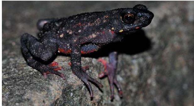
Fig. 58. Ghatophryne ornata .