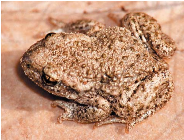
Fig. 1. Alytes obstetricans .

amplexus takes place in the water, the male kicks his legs and she rocks back and forth. As time goes on, she releases eggs and he lets go of her in order to release sperm. He then winds the stringy and fertilized egg mass, of about 180 eggs, around his ankle. He takes care of them until they become Type III larvae ready to hatch, and then will release them into a body of water so they can complete their development. This behavior is why they are called midwife toads and it is quite unique among anurans. Alytes are also nocturnal, fossorial, and may inhabit forests, ponds, or streams (Vitt and Caldwell 2009, pp. 440–441).