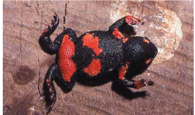
Fig. 60. Melanophryniscus atroluteus .

Species in this family are brightly colored and secrete toxins from their skin while exhibiting the "unken reflex" defensive behavior (Amphibiaweb 2013).