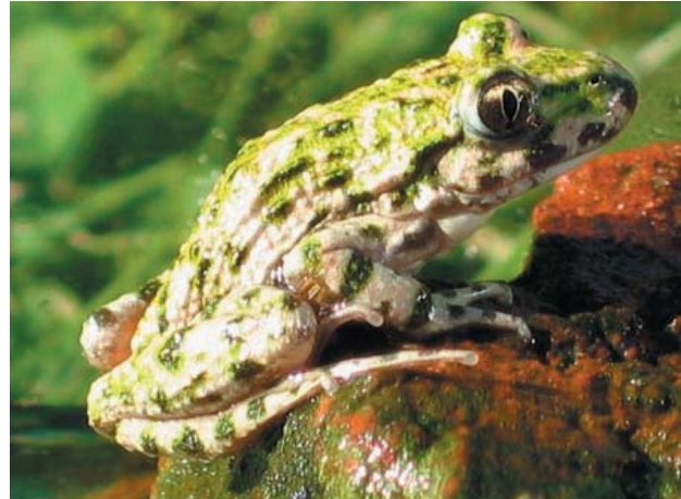
Fig. 11. Pelodytes punctatus .

From Eurasia, their name comes from some members having what looks like parsley garnish on the skin. Shared characters include fused astragalus and calcaneum (found also in glass frogs, family Centrolenidae), parahoid bone (also found in burrowing toads, family Rhinophrynidae and extinct frogs from genus Palaeobatrachus ), fused vertebrae I and II, three tarsalia bones on each foot, eight presacral amphicoelous vertebrae, arciferal pectoral