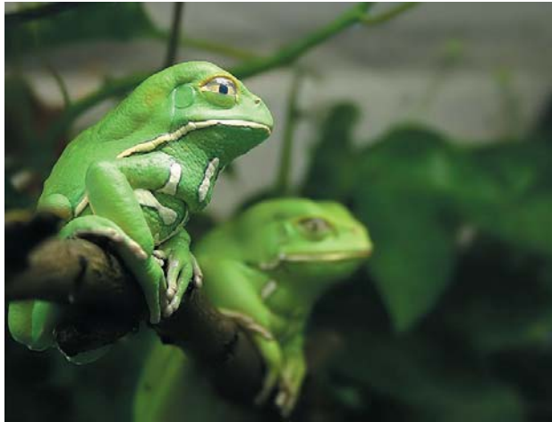
Fig. 77. Phyllomedusa sauvagii .

Pupils are vertical and many lay eggs on leaves, from which the hatched tadpoles drop into water (Amphibiaweb 2013; Vitt and Caldwell 2009, pp.452–453). They are also known for secreting antibacterial and antifungal peptides from their skin (Amphibiaweb 2013). Some change skin color from day to night, and some can glide from tree to tree (Amphibiaweb 2013). Many Phyllomedusa species are more adapted for arid environments because they can decrease their water loss by excreting uric acid rather than urea. Further, most produce a lipid secretion they can wipe along their bodies to reduce water loss from their skin (Vitt and Caldwell 2009, p. 452). After laying eggs on a leaf overhanging water, red-eyed treefrog ( Agalychnis callidryas ) embryos can distinguish sound vibration patterns between snakes, wasps, and rain fall. If vibrations are being made by wasp or snake predators they may hatch quickly to avoid predation, but will remain in the egg if vibrations are being caused by rainfall (Amphibiaweb 2013).