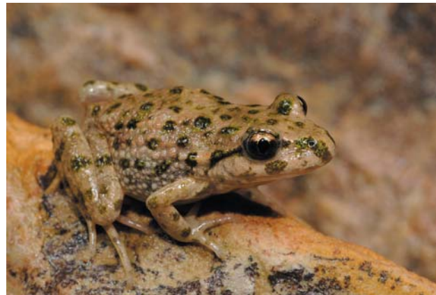
Fig. 12. Pelodytes ibericus .

Their breeding behavior is not explosive, but prolonged, where mating intensity is lower than explosive breeders and happens over a long period of time, usually consisting of two or more months. Development is indirect and tadpoles may take a year or less, depending on species, to metamorphose (Amphibiaweb 2013). Molecular data places them as a sister to the clades of Pelobatidae and Megophryidae (Amphibiaweb 2013).