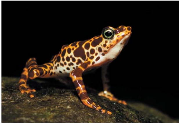
Fig. 53. Atelopus certus . Source: http://en.wikipedia.org .

These species tend to be brightly colored, small, and diurnal. These frogs are from Central and South America.