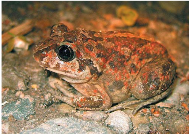
Fig. 10. Pelobates fuscus .

dorsal ribs on presacral vertebrae of post metamorphs, astragalus and calcaneum are fused at both ends, blunt tips on terminal phalanges, and short legs (Vitt and Caldwell 2009, pp.441–445). Many have bony outgrowths on the frontal and parietal bones of the skull (Amphibiaweb 2013; Vitt and Caldwell 2009, pp.441–445).