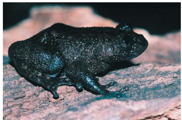
Fig. 81. Nyctibatrachus .