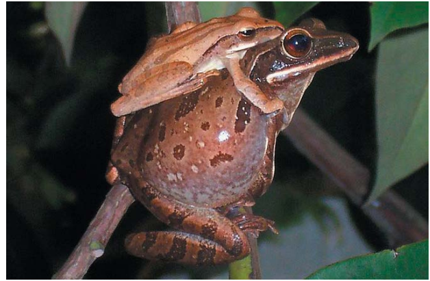
Fig. 84. Polyp leucom .

Evidence suggests that they are related to Ranidae but they are mostly arboreal having the enlarged toe