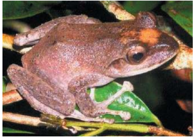
Fig 69. Platymantis vitiensis .

Some species in this family lay eggs in leaf axils of trees or epiphytic plants and development is direct, while others, such as Platymantis spelaeus are found in caves (Amphibiaweb 2013).