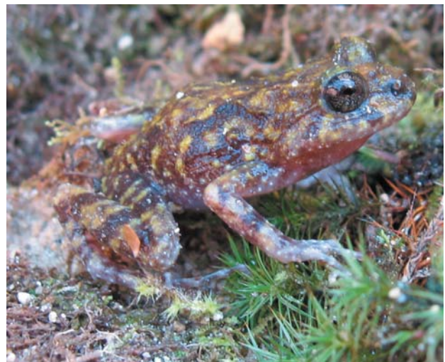
Fig. 73. Cycloramphus eleutherodactylus .

This family is found in South America, often on islands and waterfall splash zones, and its taxonomy is still in great flux. Many have unique reproductive modes and lay terrestrial eggs in rock crevices (Amphibiaweb 2013). Because of their unique behavior and locale, I group them together as a kind.