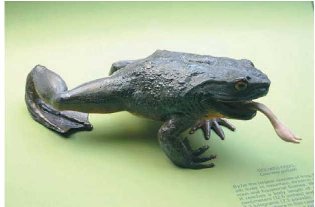
Fig. 72. Conraua goliath .

As a new family, taxonomic data is still in flux. C. goliath is reported to be the largest anuran on earth measuring 32cm (12.5") and weighing over 3kg (6.6lb)