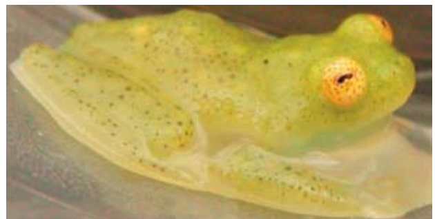
Fig. 68. Hruedai dorso .

Their family name refers to the common character of having a transparent venter, where many internal organs can be seen (Amphibiaweb 2013; Vitt and Caldwell 2009, pp. 453–454). Endemic to Central and South America, other common traits include green