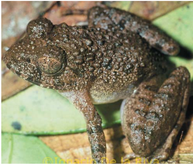
Fig. 41. Scotobleps gabonicus .