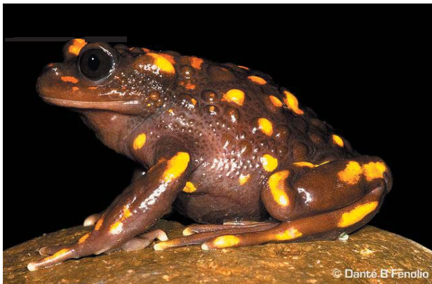
Fig. 27. Telmatobufo venustus .

T. australis characters include robust, toad-like morphology, long and slender limbs, parotoid glands (toxic glands found on many toads), vertical pupils, indistinct tympanum, maxillary and premaxillary teeth, prevomerine teeth, and smooth skin with different shape and size glands. Not much is known about the other two species.