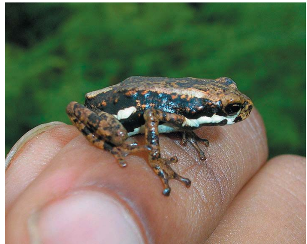
Fig. 65. Pedostibes tuberculosus .