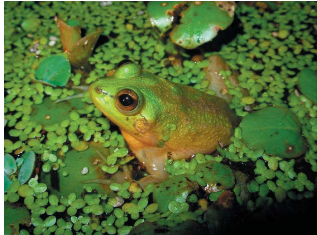
Fig. 78. Pseudis paradoxa .

A relatively new taxon of frogs from Brazil and Argentina, these tend to inhabit streams. Hylodes asper has an unusual way of communicating. Living in the loud environment of fast flowing streams and waterfalls, it would be hard to hear if it tried to vocalize, therefore it communicates by foot-flagging in which it slowly waves each rear foot, alternating them high above the body (Amphibiaweb 2013; Caldwell and Vitt 2009, p.460).