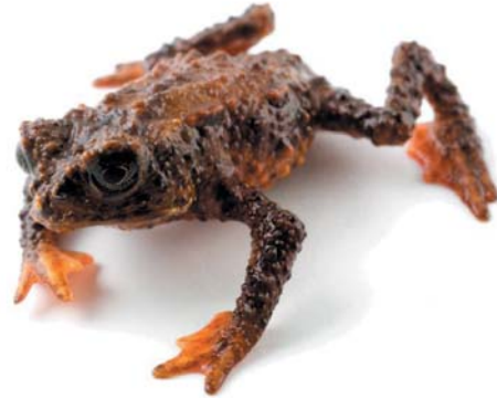
Fig. 64. Osornophryne simpsoni .

Species in this family are direct developers and fossorial (Amphibiaweb 2013).