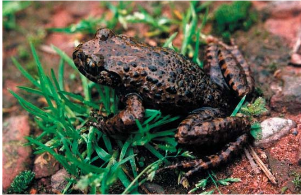
Fig. 22. Oreolalax omeimontis .