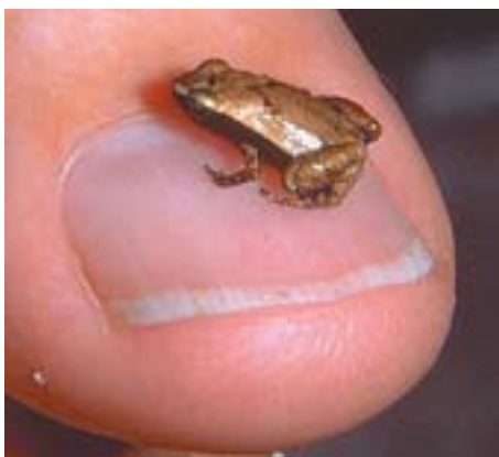
Fig. 34. Sechellophryne gardineri .

Endemic to the Seychelles they and Nasikabatrachidae are some of the only Neobatrachian members to perform inguinal amplexus, which is considered evolutionarily