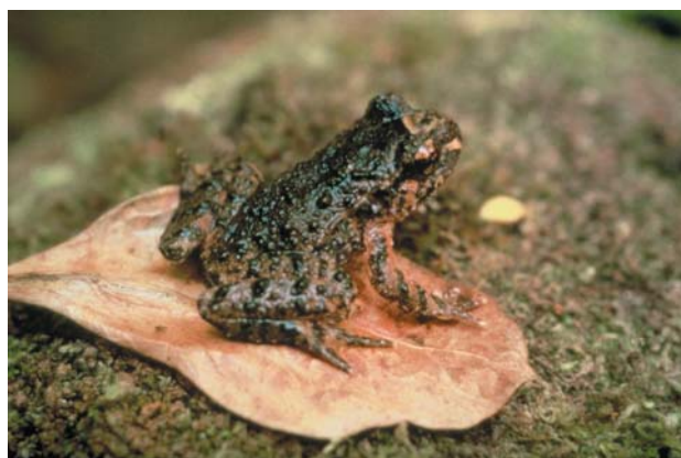
Fig. 8. Hochstetter's frog.

Only found in New Zealand, these frogs and Ascaphidae are considered primitive because the two families share traits that include nine presacral amphicoelous vertebrae and the retention of caudalip uroischiotibialis muscles (Amphibiaweb 2013).