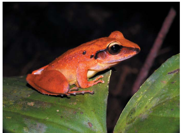
Fig. 29. Craugastor longirostris .