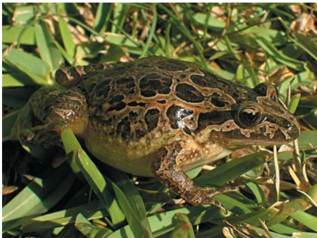
Fig. 2. Discoglossus galganoi .

Discoglossus is more aquatic, are most often found near fast flowing streams, and eggs tend to be deposited in the water and left on vegetation, rather than cared for by a parent (Vitt and Caldwell 2009, p. 441).