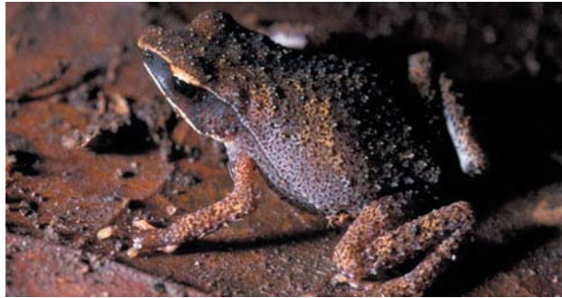
Fig. 62. Nectophrynoides wendyae .

Species in this group, along with Nimbaphrynoides (and possibly others), are the only known anurans to have both internal fertilization and give live birth (ovoviviparous) (Amphibiaweb 2013). Some feign death ( N. asperginis ) when disturbed, and have nostril covers that are designed for living in waterfall spray zones. Some males ( N. tornieri ) do pushups that may be visual displays for competing males or to increase sound transmission (Amphibiaweb 2013).