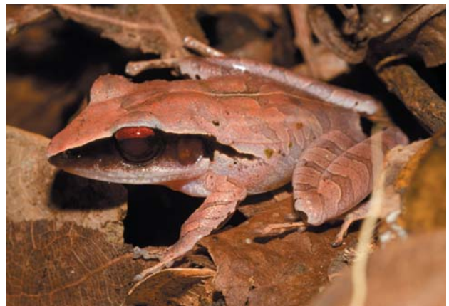
Fig. 28. Haddadus binotatus .

( Craugastor ) 113 species—SVL=4 cm (1.5")