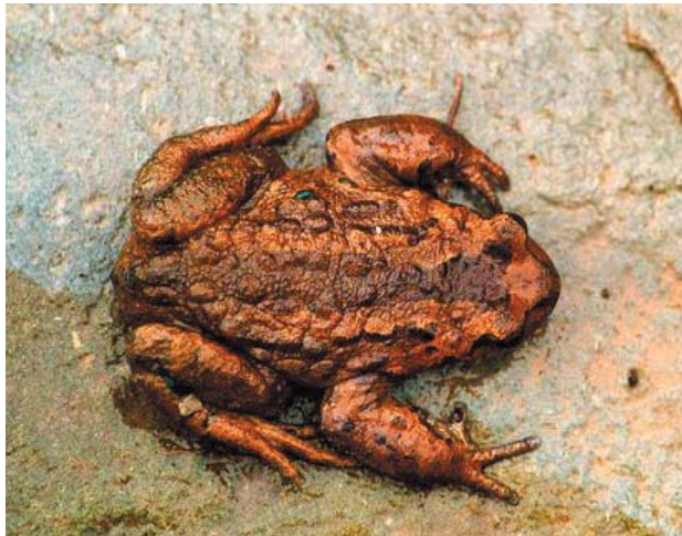
Fig. 23. Scutiger tuberculatus .

2 genera ( Brachycephalus and Ischnocnema ) 53 species—SVL=3.5 cm (1.3")