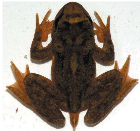
Fig. 7. Ascaphus truei .

Found in fast flowing streams from western Canada to California and into the Rocky Mountains, this family is unique in that members contain an everted cloaca ("tail") used as a copulatory organ for internal fertilization (Amphibiaweb 2013). This organ is powered by caudalipuboischiotibialis muscles, found only in Ascaphidae and Leiopelmatidae. These are the same muscles that control the wagging of a dog's tail (Amphibiaweb 2013; Cannatella 2008b). Other traits include; no palatine bones, paired frontoparietal bones, nine presacral, amphicoelous vertebrae (front and back of centrum are concave), free dorsal ribs on the second to fourth (sometimes