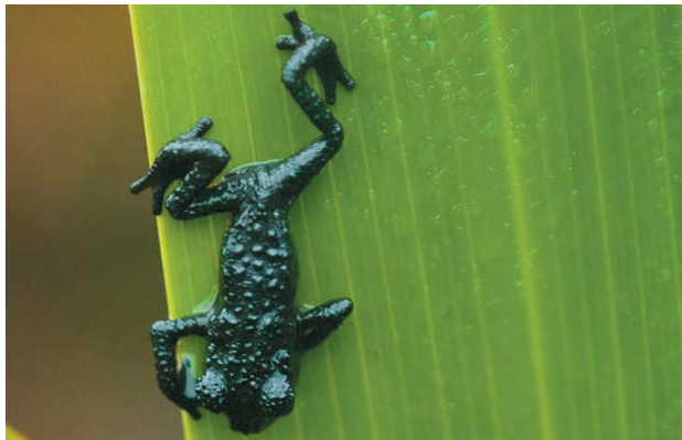
Fig. 63. Oreophrynella quelchii .

One species known as the pebble toad ( O. nigra ) has a fascinating defense tactic that is also observed in the Mount Lyell lungless salamander ( Hydromantes platycephalus ) when a predator approaches. When