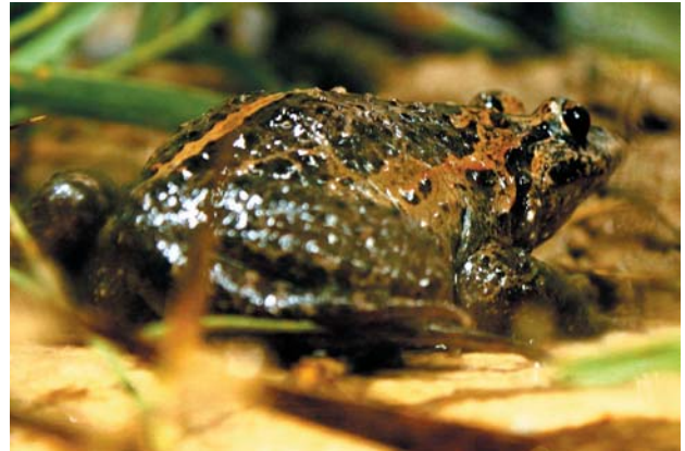
Fig. 3. Latonia nigriventer .

Latonia is a genus that has long thought to be extinct until the recent 2011 rediscovery of the Hula painted frog ( Latonia nigriventer ) from northern Galilee (Biton et al. 2013). It was the first amphibian to be declared extinct by the International Union for the Conservation of Nature (IUCN), hasn't been