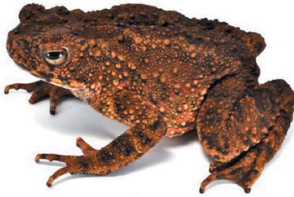
Fig. 66. Phrynoidis aspera .