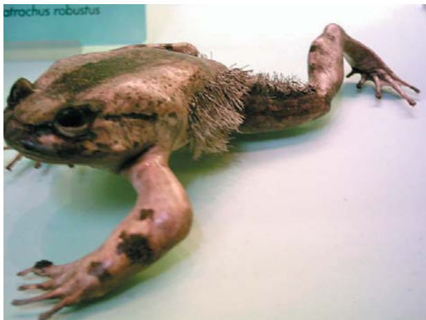
Fig. 42. Trichobatrachus robustus .

Mostly terrestrial, the hairy frog ( Trichobatrachus robustus ) may be the most well-known member of the family because breeding males have long epidermal extensions called dermal papillae that contain arteries and may increase respiratory effectiveness because of their small lungs and large body (Amphibiaweb 2013). Eggs are oviposited on rocks in streams and tadpoles are carnivorous and muscular (Amphibiaweb 2013).