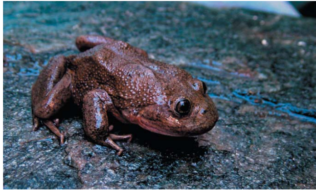
Fig. 86. Telmatobius . Source: http://en.wikipedia.org .