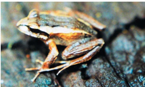
Fig. 47. Batrachyla teniata .