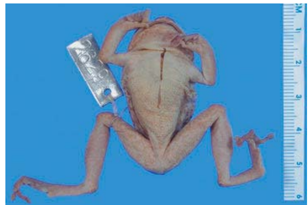
Fig. 40. Nyctibates laevis .