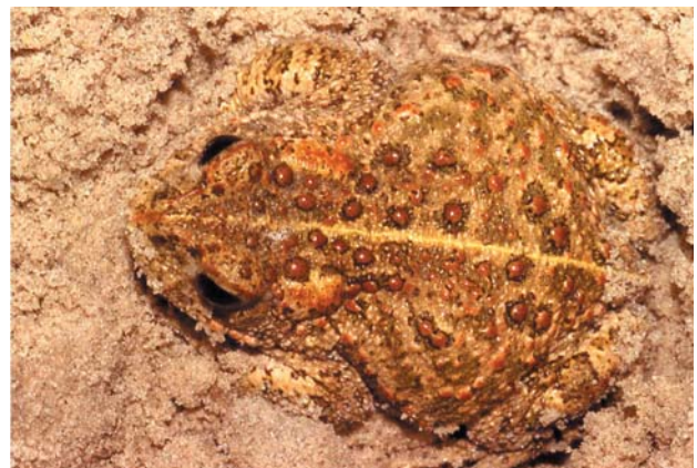
Fig. 57. Bufo calamita .