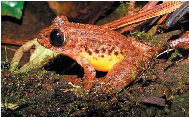
Fig. 36. Astylosternus laurenti .