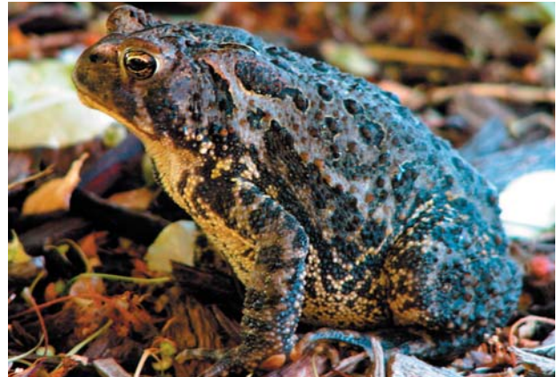
Fig. 50. Bufo americanus .

Anaxyrus (North American toads) and Bufo (Eurasian toads) used to be classified together in the genus Bufo until recently. Jensen et al. (2008) has reported interspecific hybridization in Anaxyrus . Artificial interspecific hybridization, producing fertile offspring, has been reported for the Japanese species B. japonica and B. torrenticola , but interspecific isolation seems to hold where they are sympatric in the wild (Amphibiaweb 2013). Because of similar morphology and behavior I combine both genera into the American/Common toad kind.