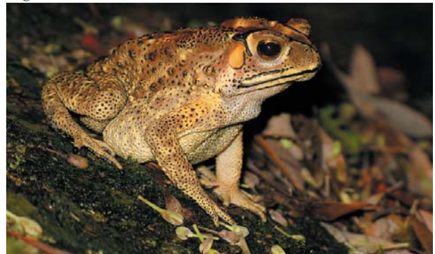
Fig. 56. Bufo melanostictus .