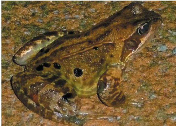
Fig. 83. Rana temporaria .

Interspecific hybridization has been reported in Ranidae including a type of reproduction called hybridogenesis (Beerli 1995). In European ranids, Rana lessonae and R. ridibunda produce a hybrid called R. esculenta . Female R. esculenta may mate with purebred males of R. lessonae or R. ridibunda and during the larval stage, the purebred male genome is lost in the gonads of R. esculenta and only females are produced.