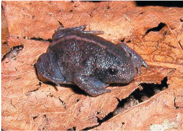
Fig. 13. Rhinophrynus dorsalis .

small eyes, anteater-like tongue that comes through a narrow opening of the mouth uniquely designed to feed underground on ants and termites, no teeth, no palatines, facial nerve exiting through the anterior acoustic foramen in the auditory capsule, eight presacral notochordal and opisthocoelous vertebrae, post metamorphs lacking dorsal ribs on presacral vertebrae, arciferal pectoral girdle, no sternum, calcaneum and astragalus fused at both ends, blunt tips on terminal phalanges, and a Type I tadpole—also found in the tongueless frogs of family Pipidae (Amphibiaweb 2013). They are explosive breeders and mate when heavy rains form large pools. Because of their uniqueness I include them as a separate Ark kind.