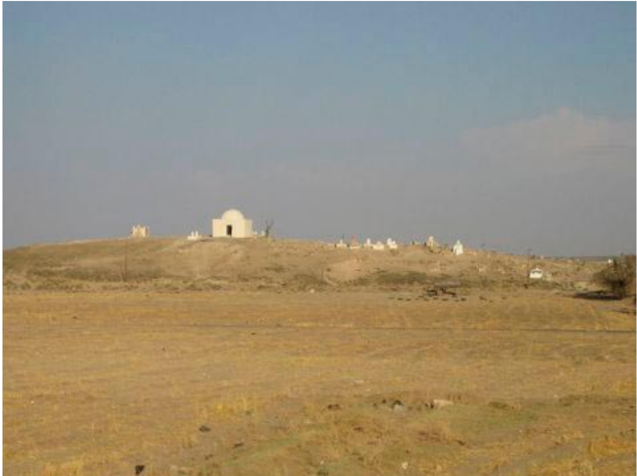
Fig. 4. Tell (el) Fakhariya, situated near the headwaters of the Khabur River close to the Turkish border, is considered by this author to be the likely location of Calneh. Scholars believe that this Tell could be Wassukanni, capital of the ancient kingdom of Mitanni; and also the later Assyrian city, Sikani.

Amos and Isaiah (Ussher 1658). This author suggests that this would be about right for the time period that we would expect for Calneh’s destruction.