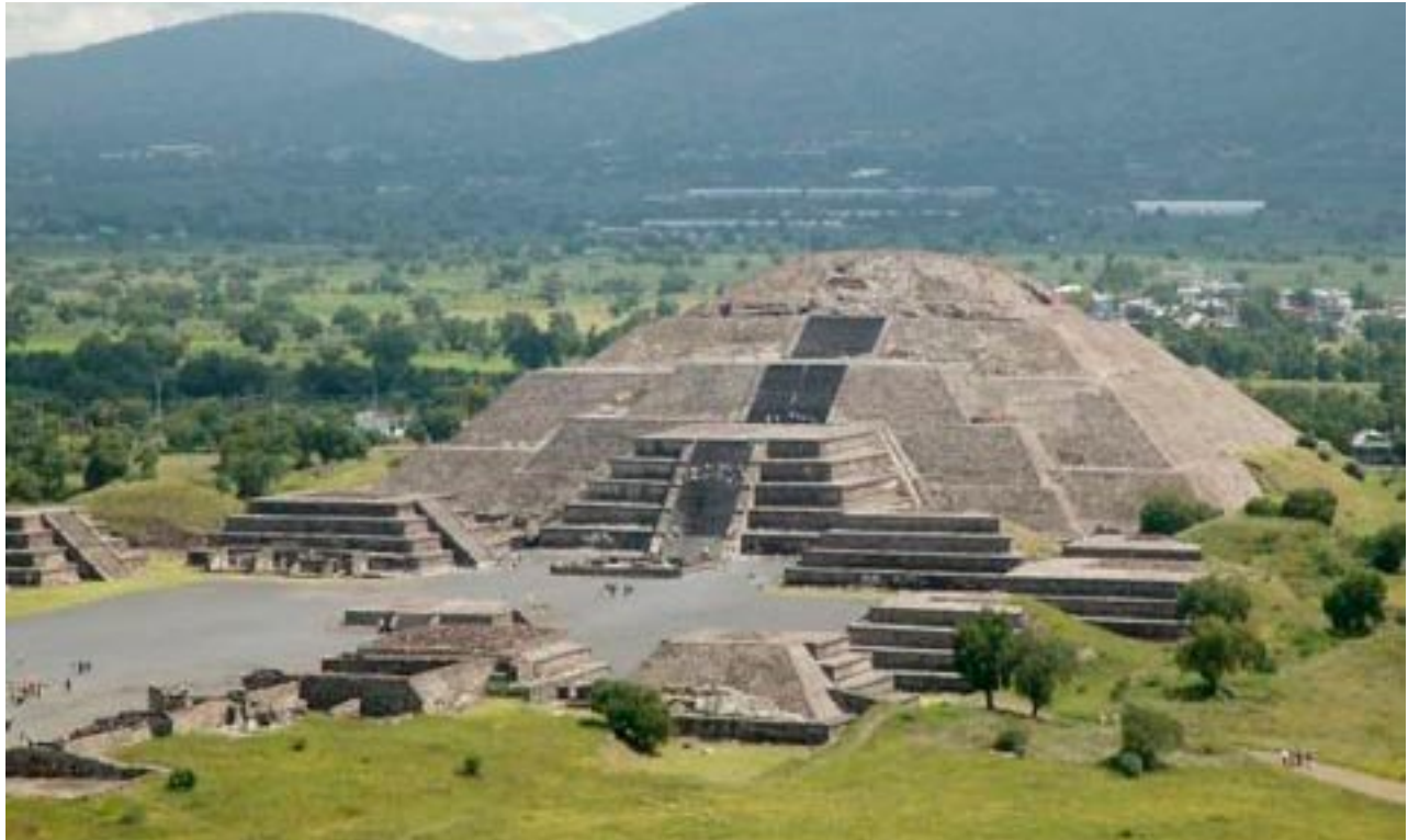
Fig. 6. The Pyramid of the Moon in Teotihuacan, Mexico, is shown above with some of the structures that accompany it. Photo by Ineuw (Pyramid of the Moon 2010).

According to Genesis 11:3, the Tower was built of “burnt” brick—that is, kiln-baked brick. This is a very durable material, and because of this, remnants of the Tower may well have survived the ages. 24 The bricks were held together by “slime” or bitumen, and availability of this material was one of the reasons for building the Tower on the plain in Shinar, as noted earlier. The biblical comment that the Babel builders used burnt brick “for stone” (Genesis 11:3) probably reflected the tradition in ancient Israel of constructing major buildings of stone, as pointed out by Kenett (1995, pp. 18–19) with respect to the quality of Solomon’s temple (these stones are mentioned in 1 Kings 5:17, 67). Stones figured importantly in Solomon’s great palace as well (1 Kings 7:9–12). Mud bricks were used in Israel for other construction, as for instance, in the tells of Dan, Hazor, Megiddo and others (Schaffer 2000).