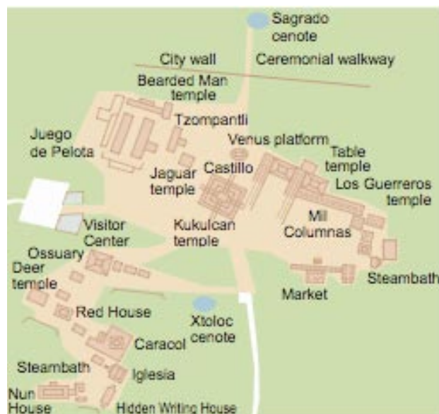
Fig. 5. The central part of the Chichen Itza complex of structures in the Yucatan Peninsula of Mexico is shown above (the Kukulcan Temple is the well-known Chichen Itza ziggurat, called "El Castillo," the castle). The building of a "city" of this type along with a ziggurat tower has persisted for thousands of years around the world, supporting the Genesis story of the city and tower at Babel. Drawing by Holger Behr (Chichen Itza 2010).

the entire area enclosed by a wall. For instance, the Chichen Itza complex in the Yucatan Peninsula of Mexico illustrates this (see fig. 5). Other examples of these ziggurat/city complexes are the Esagila of the inner city of Babylon (Oates 1979, p.148); the Chogha Zanbil ziggurat and nearby buildings in Iran (Chogha Zanbil 2009); and the somewhat more recent centers of the Pyramid of the Sun (Tompkins 1976, pp.226–240) and the Pyramid of the Moon (fig. 6), both at Teotihuacan in Mexico. The huge multi-pyramid complex at Tucúme, Peru, built about 900 years ago (Heyerdahl, Sandweiss, and Narváez 1995, p.78), and the lesser-known Dravidian temple compounds of south India with their ziggurat-like gopuram towers (see fig. 7), built as recently as 500 years ago (Das 2001), are also good examples. These geographically widespread pyramid complexes tell us that the custom of building this kind of religious and administrative center must be patterned after the original model at Babel. We would therefore look for remnants of a large number of structures that the people were building alongside the Tower itself at the Babel site.