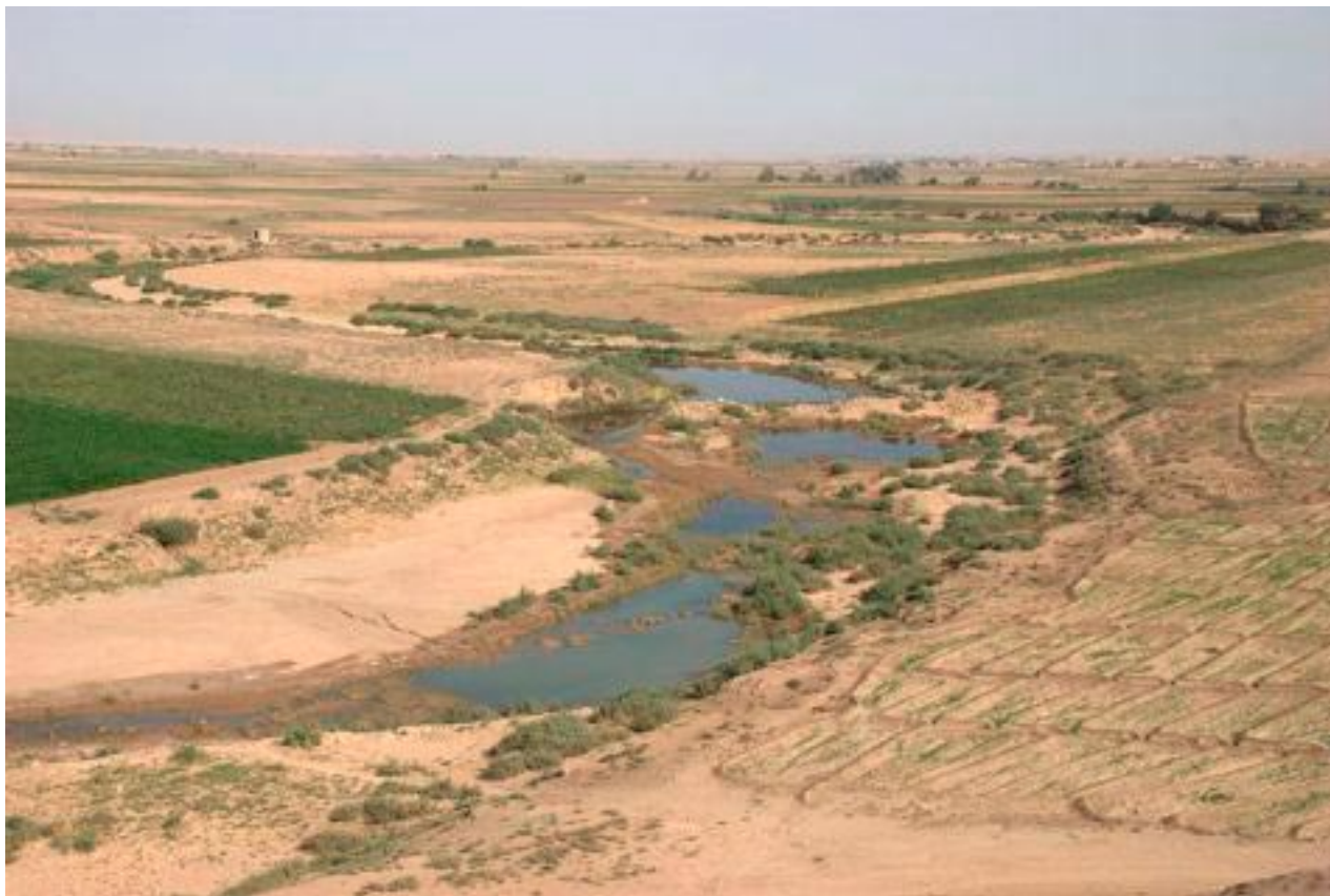
Fig. 2. The flatness of the Shinar plain is shown in this picture of the Khabur River taken south of the city of Al Hasake, near Tell Sheikh Hamad, in North Syria. The Khabur triangle, as the upper part of this river is called, is somewhat north of this spot.