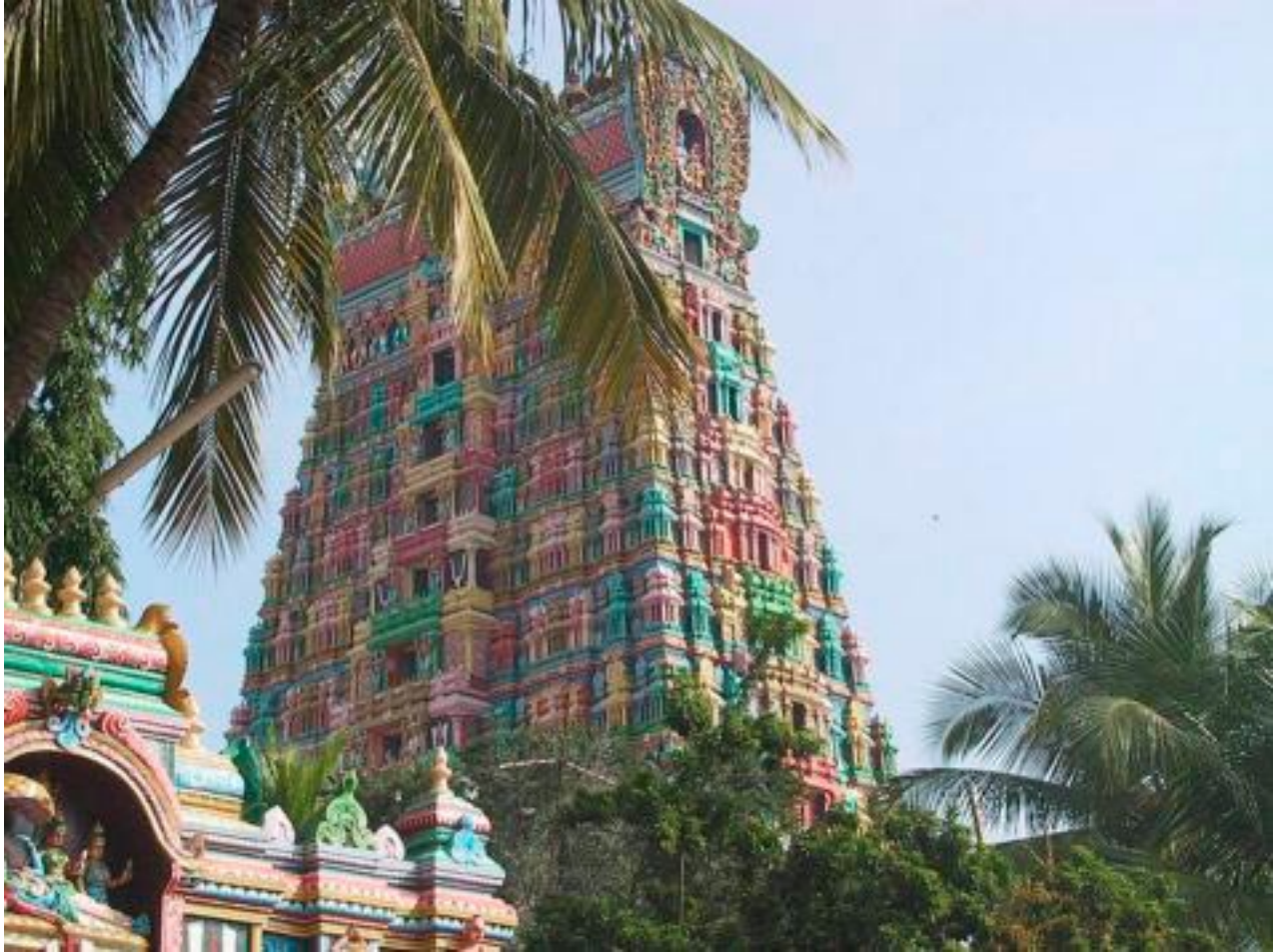
Fig. 7. The showy gopuram towers of south India, that act as gateways to their Hindu temple complexes, display a recognizable ziggurat architectural style embellished by ornate Indian sculpture. The tower shown above belongs to the Srivilliputhur Andal temple complex in the town of Srivilliputhur, 74 km (46 miles) from Madurai, India; it is the one that is shown on the government seal of Tamil Nadu (Srivilliputhur Divya Desam 2011).