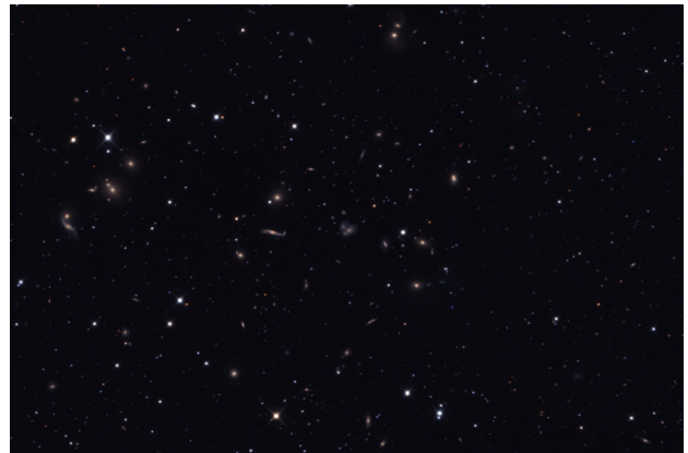
Fig. 2. The Hercules Cluster (Abell 2151).

As they began their collaboration with Prendergast, the Burbidges (Burbidge and Burbidge, 1959) first reconsidered Zwicky's work with clusters of galaxies by studying the Hercules cluster (fig. 2). Measurements of the radial velocities of galaxies in the Hercules cluster indicated that, like the Coma cluster, the dynamic mass greatly exceeded the lighted mass. The Burbidges considered three possibilities: