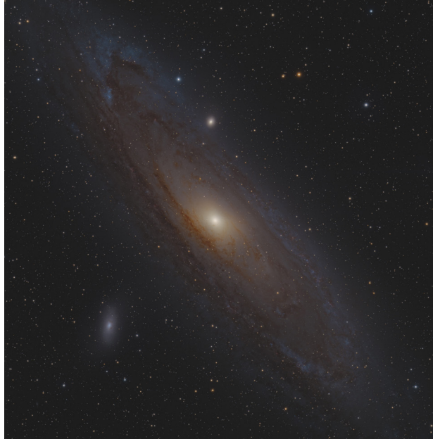
Fig. 3. M31.

The Burbidges continued to make this assumption with other galaxies, though their data on some galaxies indicated that light and mass are not correlated, suggesting that the bulk of the masses of galaxies are outside of their cores. Furthermore, there already was evidence that the distributions of light and mass in galaxies are not correlated. That was the result of Babcock's original work on the Andromeda Galaxy, M31 (fig. 3), in 1939. Three years later, Wyse and Mayall (1942) repeated and expanded upon Babcock's research on M31, and they similarly studied the Triangulum Galaxy, M33 (fig. 4). They concluded that there is no mass concentration at