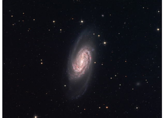
Fig. 5. NGC 2903.

Because of uncertainty in its distance, Burbidge, Burbidge, and Prendergast (1960c) found two masses for NGC 2903 (fig. 5). If the distance were 6 Mpc, then the mass is 3.7 \times 10^{10} M_{\odot} , but if the distance were 7.9 Mpc, the mass would be 4.9 \times 10^{10} M_{\odot} . They considered the greater distance (larger mass) more probable. I note that their radial velocity curve ends around 100" from the center, but that the galaxy extends out to 300".