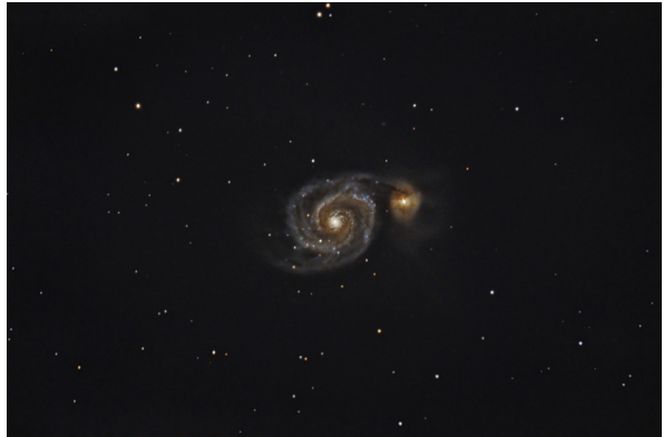
Fig. 6. M51.

M51 (fig. 6) is the famous Whirlpool Galaxy. Due to its low inclination, this is a difficult target for obtaining a rotation curve. Nevertheless, Burbidge and Burbidge (1964) did get a rotation curve, from which they determined a mass of 6 \times 10^{10} M_{\odot} or less within 5.5kpc of the center, assuming 4Mpc distance. At this distance, 5.5kpc works out to be 283'' . M51 has a diameter of 11.2' = 672'' , so its angular radius is 336'' . Thus, the rotation curve encompasses 84% of M51's extent. As with other rather complete rotation curves, M51's rotation curve does not show Keplerian decline past the turnover point as was expected.