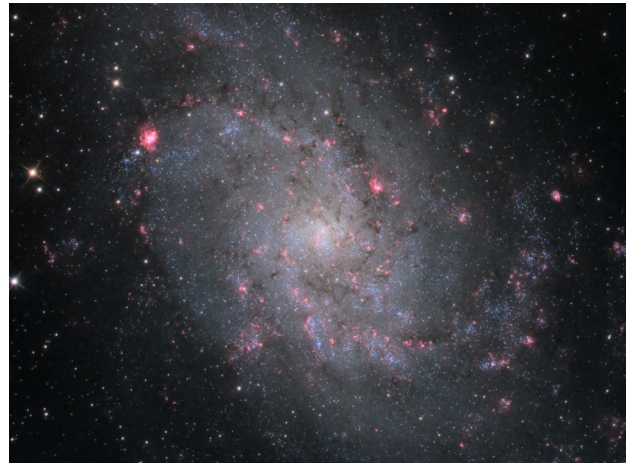
Fig. 4. M33.

the centers of either M31 or M33. Rather, for both galaxies they found an increasing mass-to-light ratio with increasing distance from the centers of galaxies. While this indicates significant dark matter outside of the nuclei of either galaxy, Wyse and Mayall did not comment on the possibility of dark matter. They did contrast their result for these two galaxies to the central concentration of matter in the Milky Way galaxy generally understood at the time and suggested that it might be in error. It is likely that the assumption that all galaxies have mass concentrated in their nuclei stemmed from this wrong conclusion about the Milky Way.